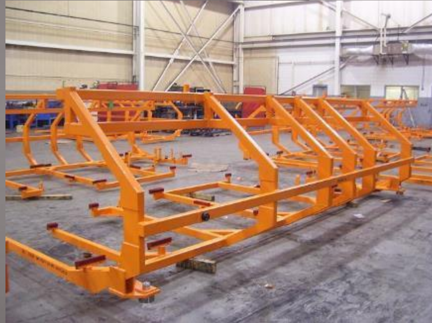
Sprint Bodyside Carriers