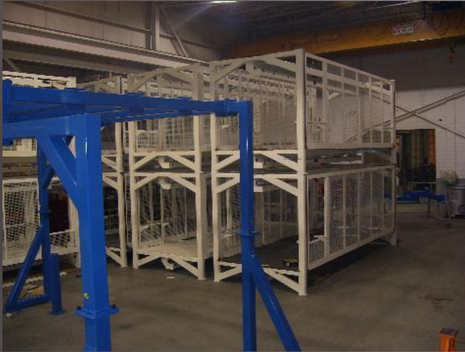
Condos and Leg Structure