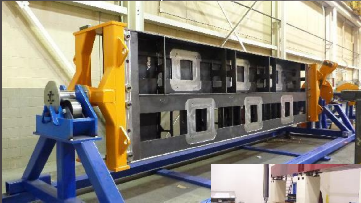
BRIC – Robot Balcony