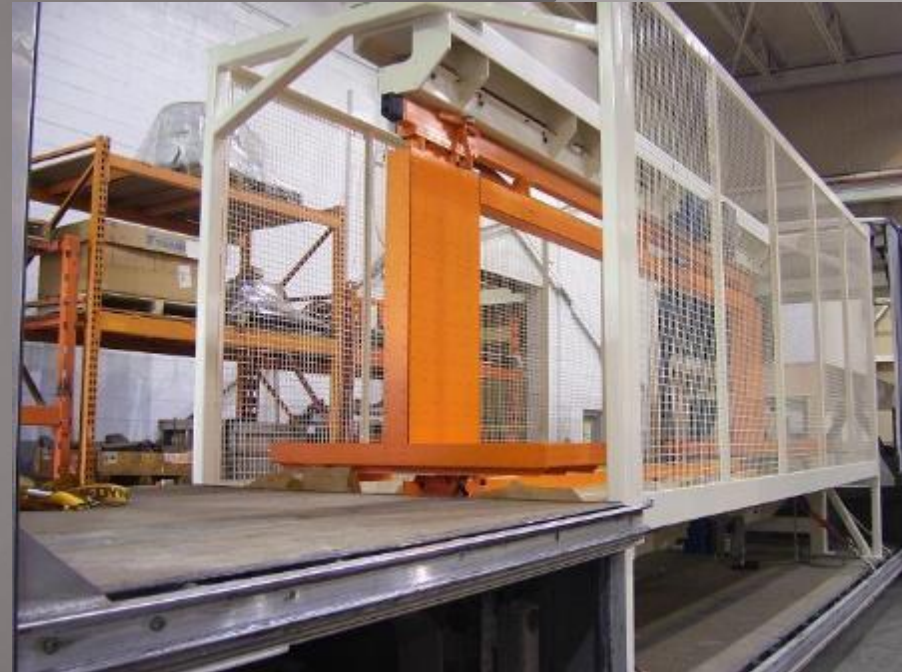
P552 SPD Bodyside Carrier