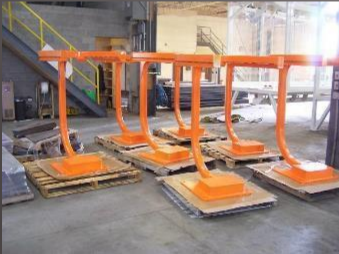
Engine Block Carriers