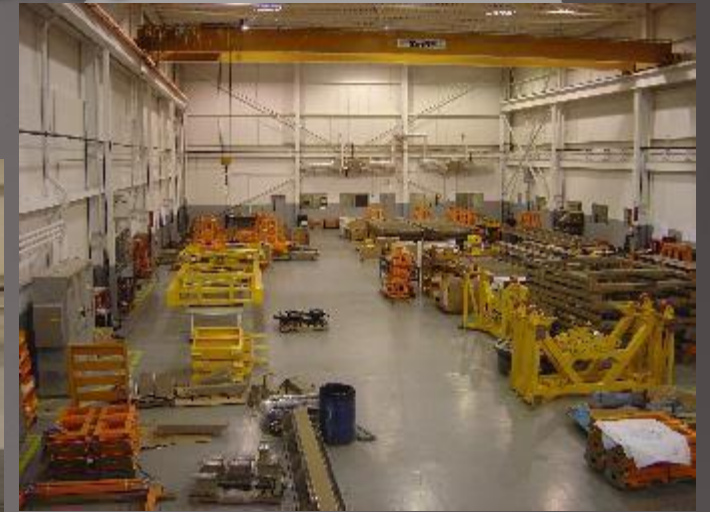
Power Roll Beds and Shuttles